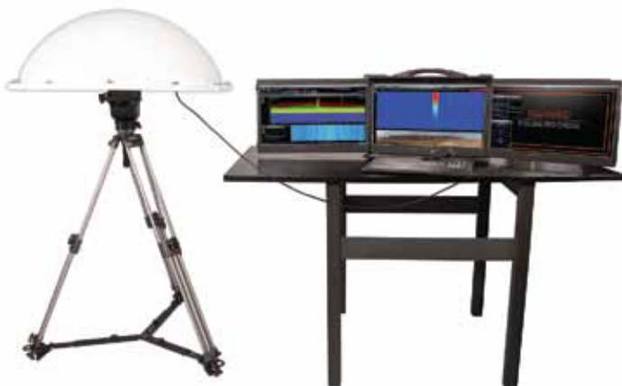
A fixed installation can use the Command Centre

Once a signal has been detected, its approximate bearing will be shown to an accuracy that depends on which model of antenna is being used. With the standard IsoLOG 3D 80-UWB, the bearing accuracy will be at least within the 45-degree