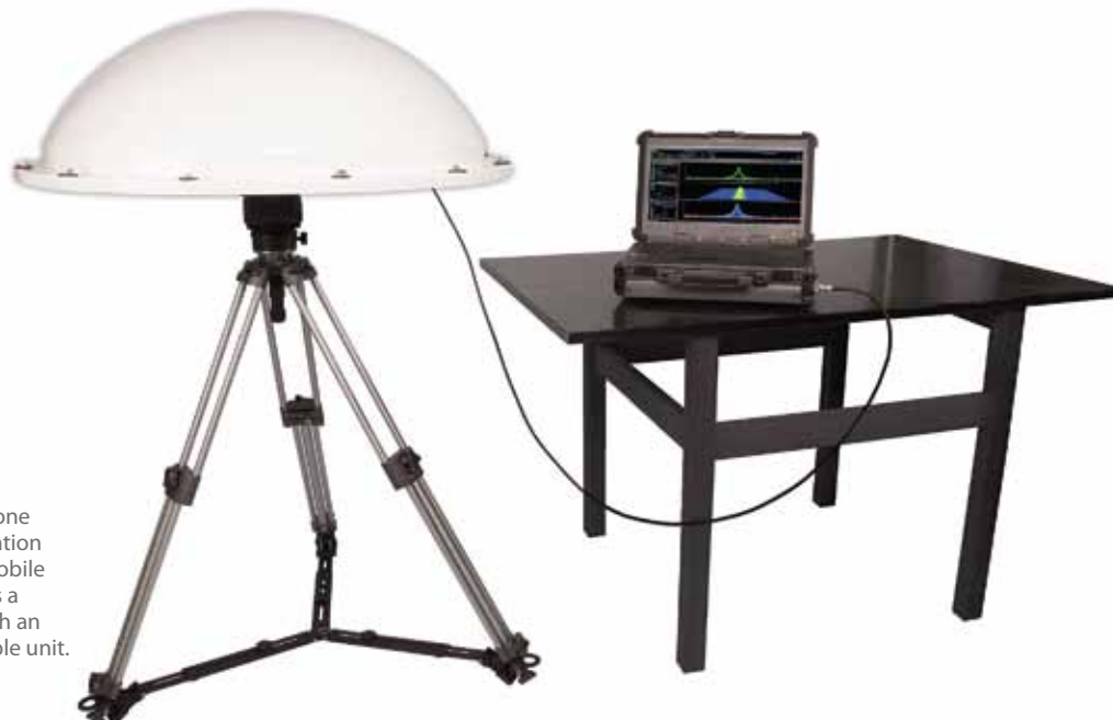
The most basic Drone Detector configuration is best suited to mobile operation. It teams a single antenna with an XFR V5 PRO portable unit.

The German company, Aaronia, recognised the need for a reliable method to detect tiny airborne intruders. Following a four-year development programme, it launched the Drone Detector, a product that exploits the radio-frequency (RF) radiation emitted by the UAV's onboard systems and by the operator's control unit. Real-time RF signal detection, combined with what the company terms "pattern triggering,"