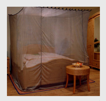
Rectangle shielding canopies made of Aaronia Shield<sup>®</sup> offer maximum shielding against LF and HF loads

The canopies should be washed by hand without bleach and without spinning and/or wringing out to avoid damage and mechanical effects on the fabric. Careful shaking out is recommended for the matching floor mats. Excessive friction and force on the fabric should be avoided.