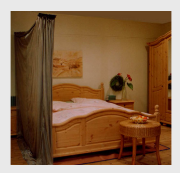
Simply practical: Aaronia rectangle canopies can be "pushed to the side" in a few easy steps