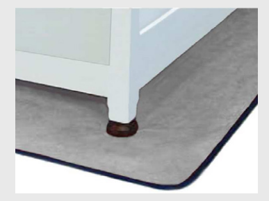
Shielding mat made of Aaronia X-Dream®